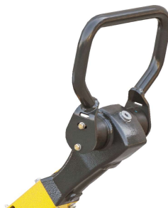
Precise and save to operate Comfortable control lever