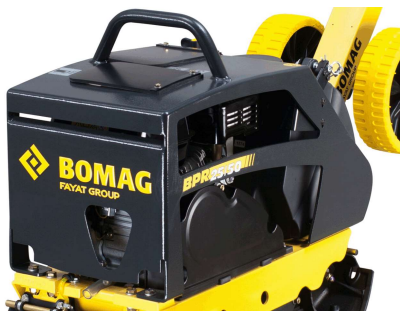
Robust and reliable Best component protection