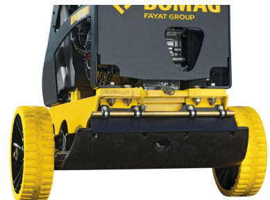
Simple and safe transport Transport wheels (optional)